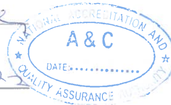
Signature Director of Quality Assurance (DQA), National Accreditation and Quality Assurance Authority